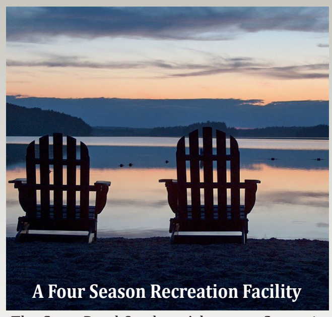
Outdoor Adventure Center

The Great Pond Outdoor Adventure Center is located in Great Pond, Maine. This 375-acre reservation boasts excellent fishing, hiking, canoe and kayaking as well as magnificent scenic vistas. This pristine site offers many opportunities to explore Maine.